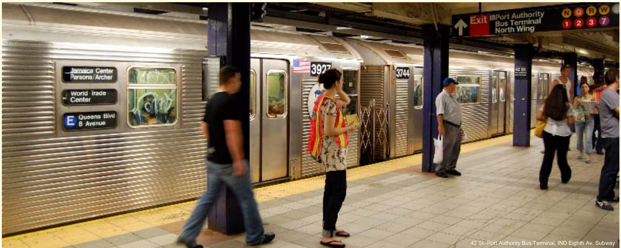
42 St.-Port Authority Bus Terminal, IND Eighth Av. Subway