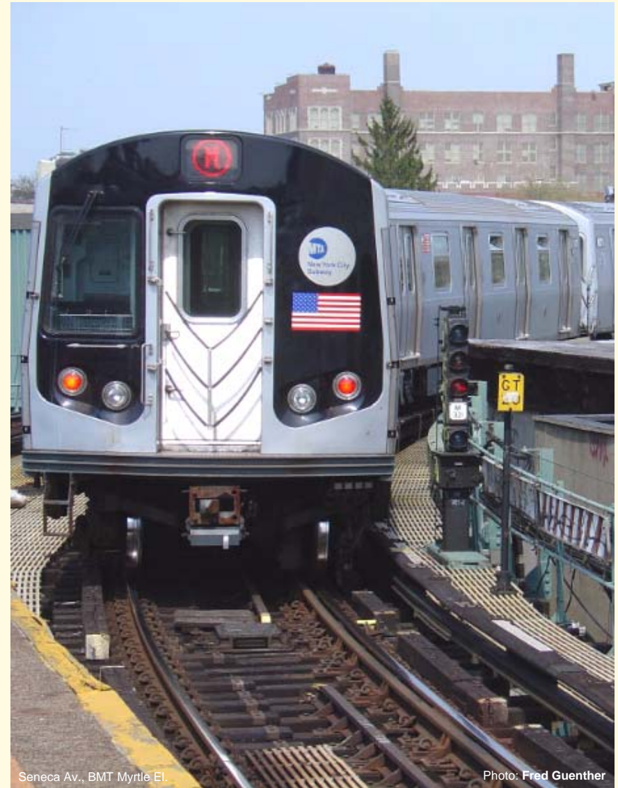
Seneca Av., BMT Myrtle El.