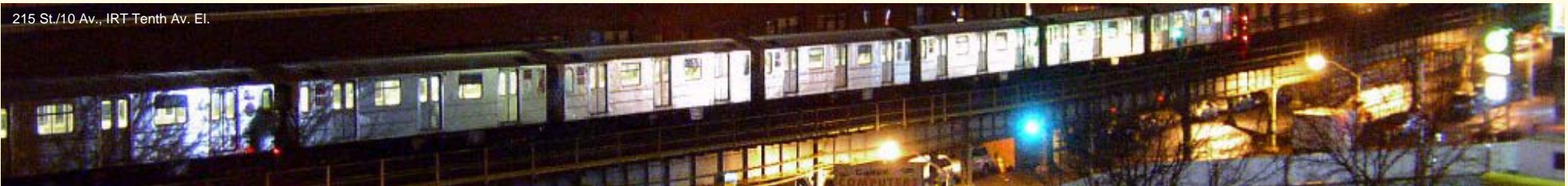
215 St./10 Av., IRT Tenth Av. El.