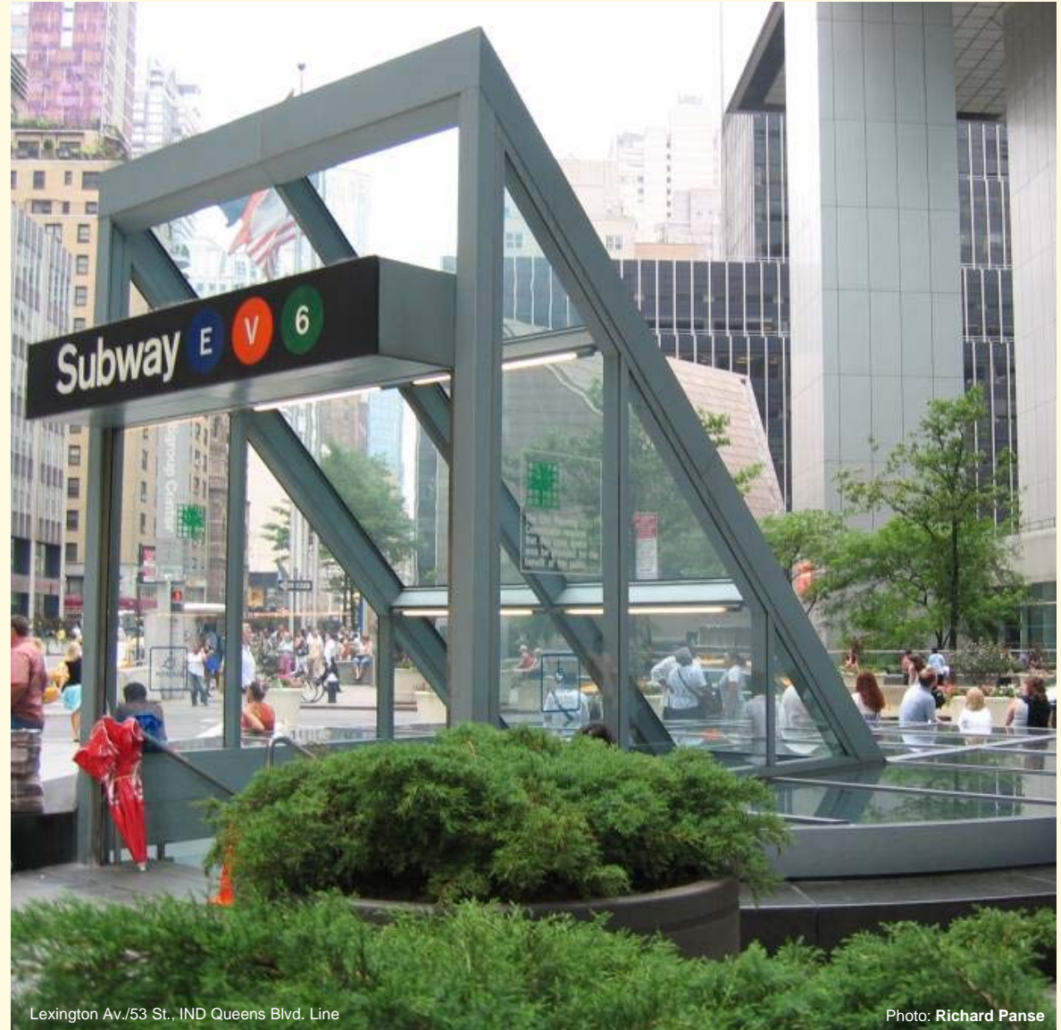
Lexington Av./53 St., IND Queens Blvd. Line