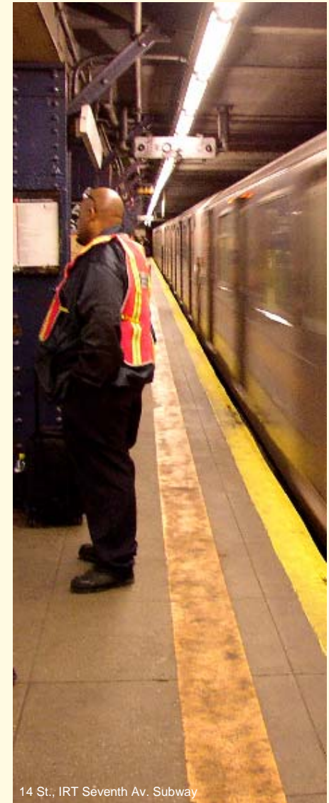
14 St., IRT Seventh Av. Subway