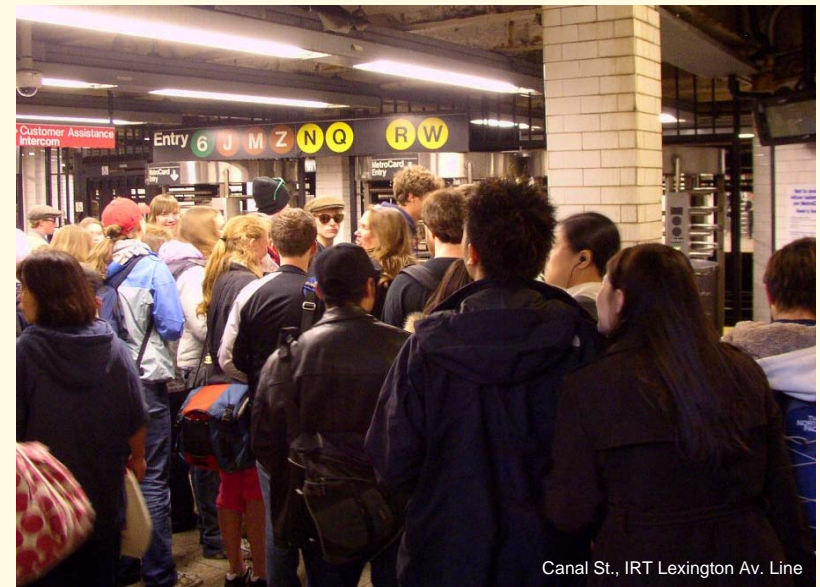
Canal St., IRT Lexington Av. Line